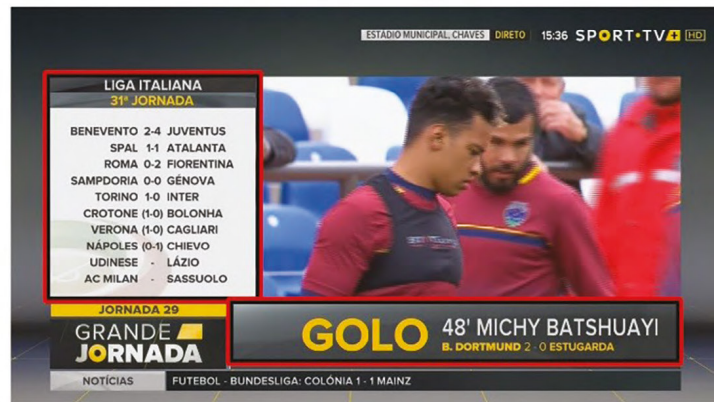
Examples of Grande Jornada’s on-screen graphics, powered by Stats Perform data

“Sport TV decided to launch a free channel to promote and trigger new subscriptions for its premium sports content,” he explains.